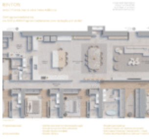
Senna Tower Floor Plan